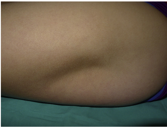
Figure 1 Semicircular depressed plaque measuring 9 × 7 cm, covered with normal skin and located on the anterolateral aspect of the left thigh.

Localized lipoatrophy secondary to drugs is characterized by the presence of depressed, asymptomatic lesions with a color and appearance similar to that of the adjacent skin. The lesions typically appear a few weeks or months after the injection and are usually located on the anterolateral aspect of the thighs, buttocks, or abdominal region.