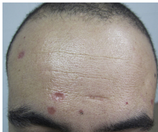
Figure 1 Erythematous papules with an atrophic central zone, situated in the frontal region.

Physical examination revealed an erythematous annular maculopapular rash with central atrophy in the frontal region, in areas in which there were no previous scars (Fig. 1). Histology of a biopsy from 1 of the lesions in the frontal region revealed a granulomatous inflammatory infiltrate formed mainly of a number of Langhans-type giant cells and epithelioid cells (Fig. 2). Given the patient's history of tuberculosis, Ziehl-Neelsen stain and polymerase chain reaction (PCR) for mycobacteria were performed on the skin biopsy sample, with a negative result, compatible with cutaneous sarcoidosis. In view of the dermatologic findings and persistence of the patient's dyspnea, transbronchial biopsy was performed. This showed numerous granulomas with no necrosis, but with fibrosis and a discreet peripheral ring of lymphocytes; Ziehl-Neelsen stain was negative.