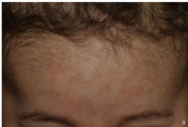
Figure 3 Hyperpigmented macules in the frontotemporal region of a 1-year-old girl of South American origin.

The differential diagnosis to be considered during the initial evaluation of a patient with hyperpigmented macules includes a large group of disorders of very varied etiology, pathogenesis, and prognostic significance (Table 1). Postinflammatory pigmentation is the most common cause of transitory acquired hyperpigmentation in children. Pityriasis versicolor presents as hypo- or hyperpigmented macules with scaly desquamation; in children this disease can have