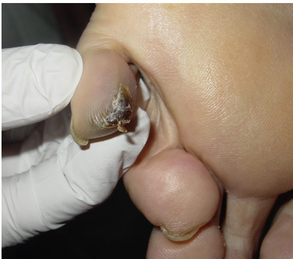
Figure 1 Image of the primary tumor in the patient with lymph node metastases in the left groin. A dark, kerotic pigmented lesion measuring 1.5 \times 1 cm can be seen, with the Hutchinson sign, on the ball of the left little toe.

highlight how a complete body examination can assist in early diagnosis of a high percentage of melanomas in patients who attend the clinic for another reason. 12-18