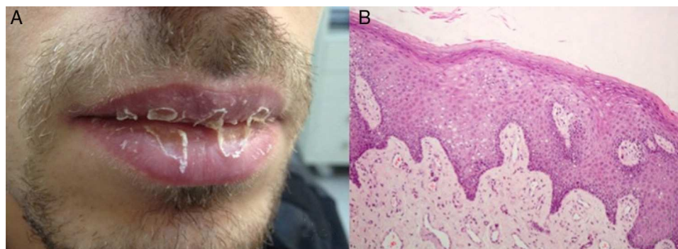
Figure 2 (a) Whitish scales on the vermilion borders of both lips in patient 2 before treatment. (b) Mounds of parakeratosis and hypogranulosis, acanthosis, and dilated, vertically elongated papillary vessels (hematoxylin-eosin, original magnification \times 20 ).

neous manifestations by at least 2 months. 5,6 Brenner et al. 7 reported a case of psoriatic cheilitis triggered by protruding teeth as a result of Koebner phenomenon; the condition was resolved by replacing the teeth with a nonirritating prosthesis. Table 1 summarizes the main epidemiological and clinical characteristics of all the cases reported to date, including ours. Perioral psoriasis as a single site of involvement can pose significant diagnostic difficulties. Due to a lack of specific diagnostic criteria, it has been suggested that a chronic course, with resistance to treatment and frequent recurrences, should raise the suspicion of psoriatic cheilitis. 1 A positive family history and HLA typing have also been described as important in supporting the a diagnosis of perioral psoriasis.