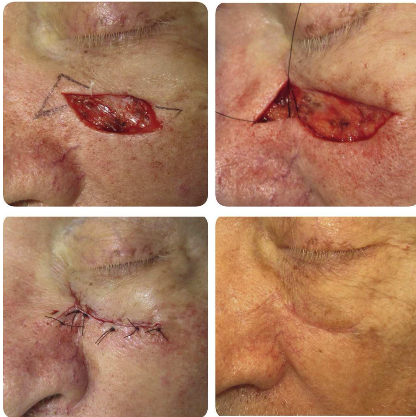
Figure 3 Case 2. Surgical resection of a malignant tumor leaving a defect in the infraorbital region. Closure using a Burow triangle or wedge-shaped resection.