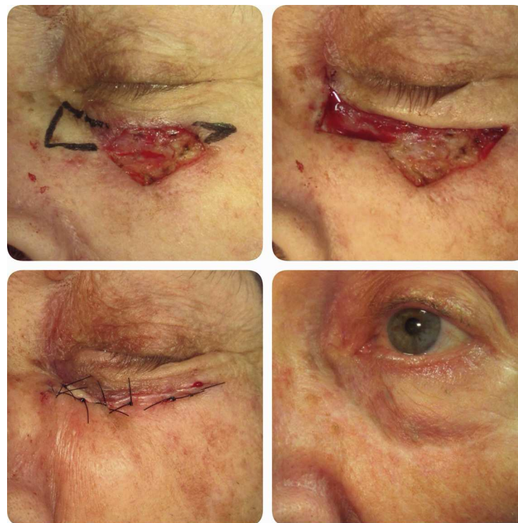
Figure 2 Case 1. Surgical resection of a malignant tumor leaving a defect in the infraorbital region. Closure using a Burow triangle or wedge-shaped resection.