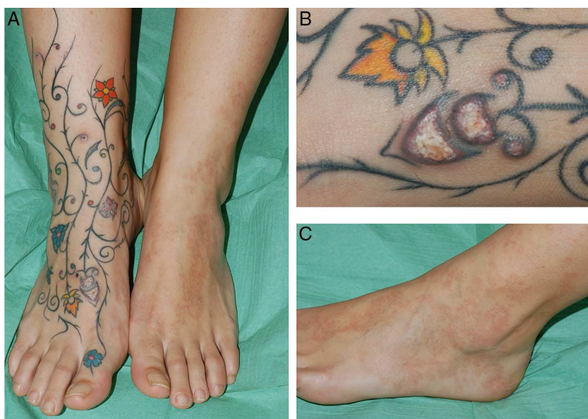
Figure 2 A, Lesion No. 2: The image shows erosions and release of material to the red areas of a multicolored tattoo on the dorsum of the right foot (B). C, Granuloma annulare lesions can be observed on the dorsum of the left foot.

We observed 1 case of granuloma annulare that occurred simultaneously with and at a distance from a granuloma-