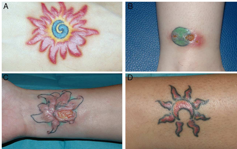
Figure 1 A, Lesion No. 1: The image shows inflammation of the red areas in a multicolored tattoo. B, Lesion No. 3: The image shows ulceration and inflammation on the red area of a red and green tattoo. C, Lesion No. 4: The image shows a large ulcer in the red areas of a green, red, and black tattoo. D, Lesion No. 5: The image shows inflammation of the red area of a tattoo that first appeared 5 months after the appearance of lesion No. 4 in the same patient.

adverse reactions. Red tattoo pigments were traditionally made from mercury derivatives, then from cadmium derivatives, which are currently prohibited because of toxicity. 3,4 Today, tattoos contain synthetic organic pigments, which carry a lower risk of adverse reactions. The problem is that there are no strict regulations on pigment content, and most professional tattoo artists do not know the composition of the pigments they use. 1 People receiving a tattoo are for the most part unaware of the substances being injected and of their possible adverse effects. In 2008, the Spanish Agency for Medications and Medical Devices drafted a list of authorized registered products that should not exceed the maximum limits for harmful substances, such as mercury,