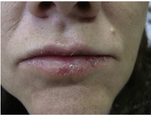
Figure 1 Chronic eczematous involvement of the lip (presenting complaint).