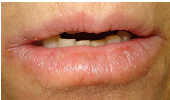
Figure 3 Chronic cracked cheilitis.

Phototesting was performed, as was patch testing with the standard GEIDAC series, a cosmetic series, an acrylate series, and the patient's own products, including all the ophthalmic ointments and eyedrops. The results were