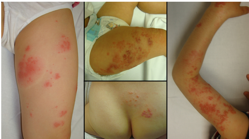
Figure 1 Clinical characteristics of the herpes zoster lesions in 4 of the patients in our series.

In conclusion, we have presented 8 cases of HZ; all patients were under 5 years of age, healthy, and had been vaccinated for VZV. Although cases of reactivation of the Oka strain of VZV have been reported, recent studies found no increase in the incidence of HZ in vaccinated children. 7 However, no epidemiological studies have assessed the true incidence of HZ in children since the introduction of routine vaccination in Spain. Molecular characterization of the virus could provide more information on the incidence of HZ after VZV vaccination.