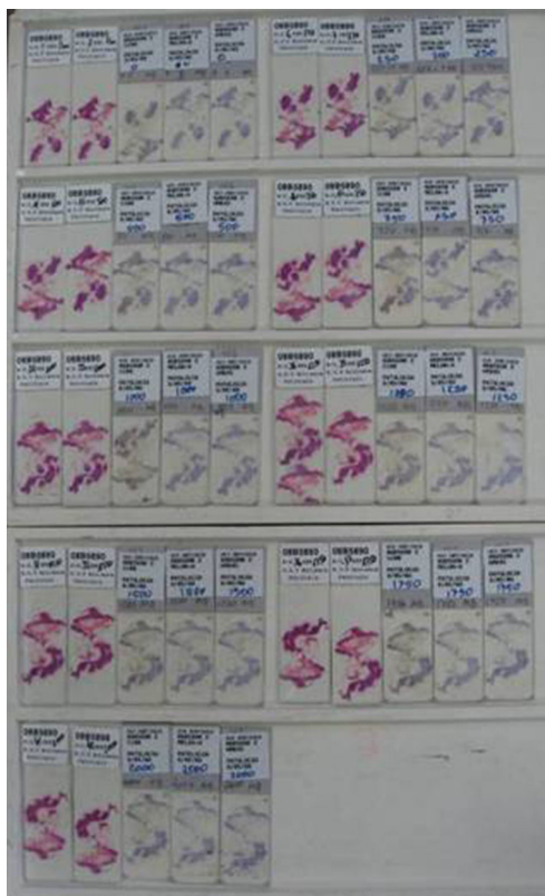
Figure 2 Sections obtained from histologic processing of a single sentinel node.

The mean Breslow thickness was 2.02 mm (median, 1 mm); 20% of the cases were node-positive. A mean (SD) of 1.96 (1.46) nodes (95% CI, 0.50–3.42 nodes) were excised per patient (median, 1); for cost estimates, the mean was rounded up to 2. Table 1 shows descriptive data for the series. The Breslow thickness was less than 1 mm in 44 (44%)