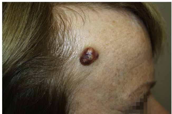
Figure 1 Clinical image showing a multicolor excrecent tumor measuring 15 mm across, with a well-defined border in the right frontoparietal region.

Pilomatrixoma or pilomatricoma is a relatively common benign cutaneous tumor that is derived from immature cells in the matrix of the hair follicle. It presents clinically as a slow-growing solid nodular lesion. There are 2 peaks in its incidence, the first during the first 20 years of life and the