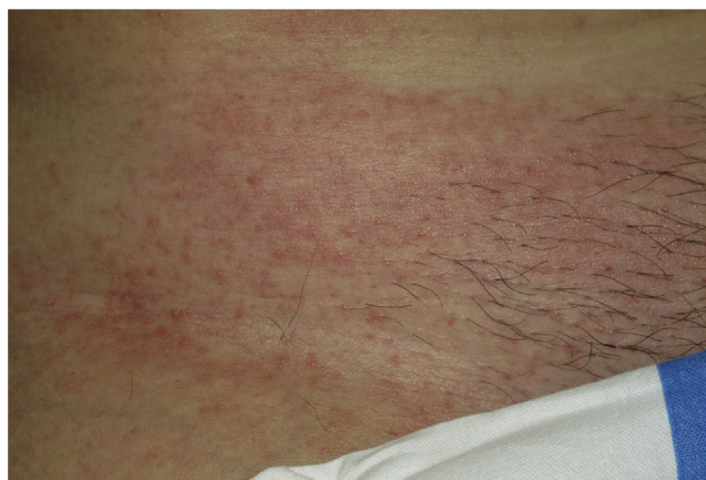
Figure 2 Lesions in the form of erythematous papules and macules on the trunk of a patient with telaprevir-induced grade 1 eruptions.

In order to rule out other skin processes and establish a correlation between clinical and histopathologic findings, we performed a skin biopsy in 7 patients. Most biopsy specimens (6/7) showed a pattern of spongiotic or interface dermatitis, which was associated with a superficial and deep perivascular infiltrate containing eosinophils. In 1 case, we observed a pattern of leukocytoclastic vasculitis