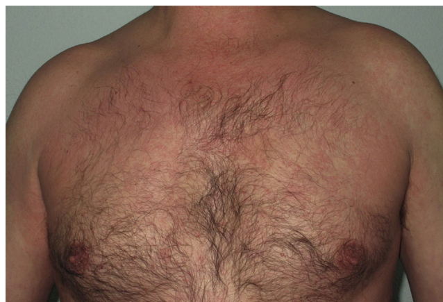
Figure 3 Telaprevir-induced eruption: erythematous lesions on the upper body of a male patient.

Finally, SVR was achieved after 24 weeks of antiviral therapy in 34 of the 43 patients studied (79%).