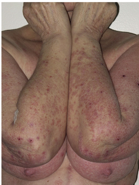
Figure 4 Excoriated erythematous-violaceous plaques on a female patient with telaprevir-induced eruption.

more likely. The specific clinical characteristics that are considered risk factors include age over 45 years, obesity, white ethnicity, and no previous treatment. 15