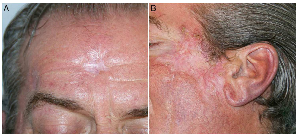
Figure 4 A and B. Clinical outcome after 12 months of tuberculosis treatment.

without having to resort to treatments such as corticosteroids or other treatments to manage the clinical worsening (Figure 4).