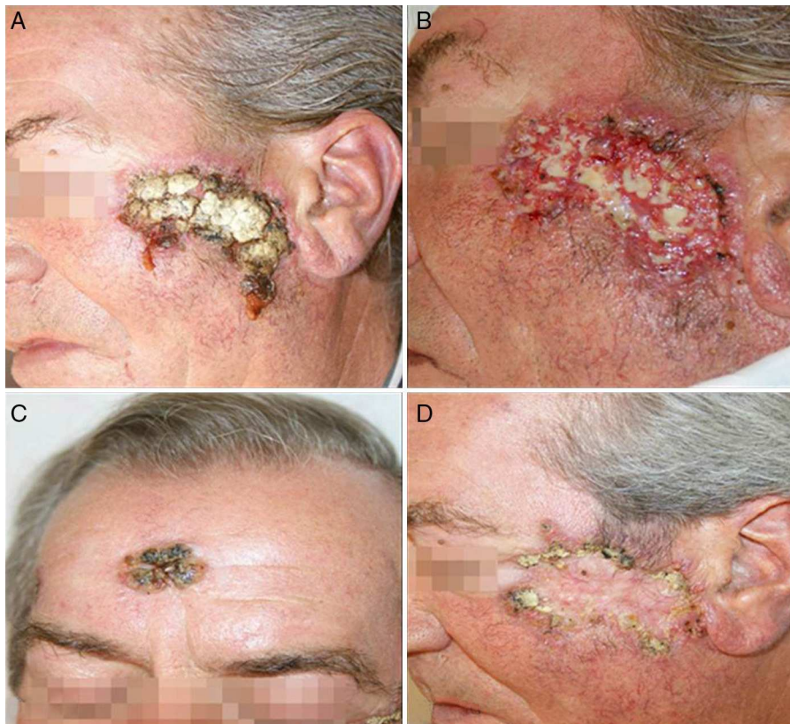
Figure 3 A and B. Appearance of lesions with severe inflammatory reaction, scab formation, and suppuration 1 month after start of tuberculosis treatment. C and D. At 4 months after start of treatment.

remained normal and no further liver toxicity was detected. Tuberculosis treatment continued at the same dose. The dressing on the scabby inflammatory lesions was replaced and progressive improvement was observed. Finally, a good outcome with respect to the initial lesions was obtained,