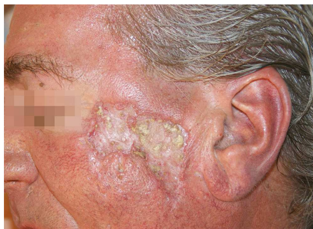
Figure 1 First visit. Depressed plaque with central scarring and a raised border, on the left zygomatic region.

When assessed in our clinic, the patient had an extensive depressed plaque with central scarring and a raised border, measuring 6.5 cm across along the long diameter, in the left