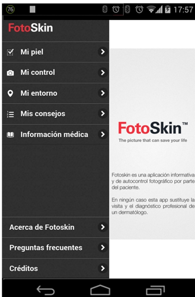
Figure 1 General design of the smartphone application FotoSkin®.

storage, automatic reminders about self-examinations, and, in particular, portability (patients can take their photographs with them when they visit the dermatologist). FotoSkin® is free to download and use and is available for iOS (iPhone, iPad) and for Android.