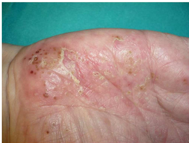
Figure 2 Desquamating erythematous plaques with pustules on their surface. These developed on the palms of a patient on treatment with adalimumab for rheumatoid arthritis.

in the latter group developed psoriasis after a follow-up of 2.81 years.