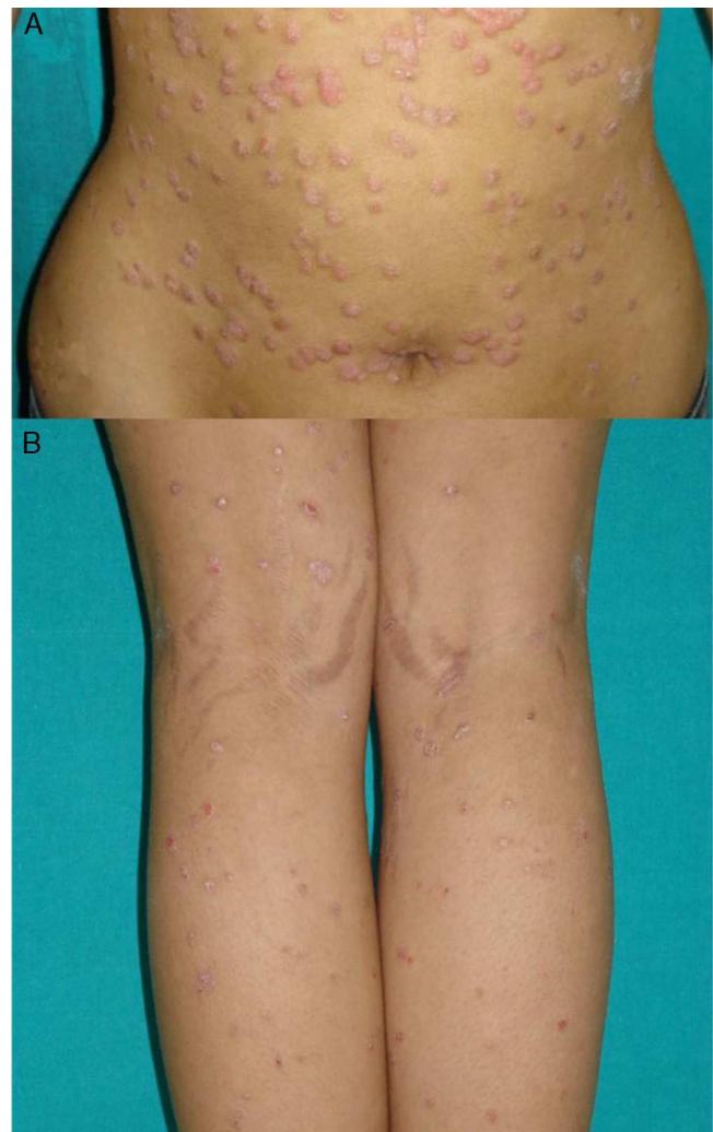
Figure 3 Patient with a history of plaque psoriasis who presented a sudden outbreak of small desquamating erythematous plaques with a drop-like appearance: A, On the abdomen. B, On the posterior aspect of the lower limbs.

Few data are available in the literature on exacerbations in which the morphology of the psoriasis changes during treatment with biologic agents. Our experience suggests that this type of reaction is more common than the literature to date would indicate. In 2007, a paper published by our department described 8 cases of new onset or exacerbation of psoriasis. 31 Six of those patients developed guttate psoriasis between 15 days and 18 months after starting treatment with etanercept for severe plaque psoriasis. None of the patients presented other triggers. Substitution of the biologic agent by ciclosporin was necessary to control the