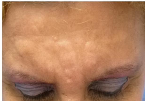
Figure 1 Yellowish-pink plaques of variable size and with well-defined borders on the forehead.

ify what the material was. On biopsy there were abundant foamy histiocytes suggestive of a histiocytic reaction to the filler material (Fig. 2). Due to the lack of specific findings, we decided to perform skin ultrasound to identify the filler material employed. The study revealed hyperechoic