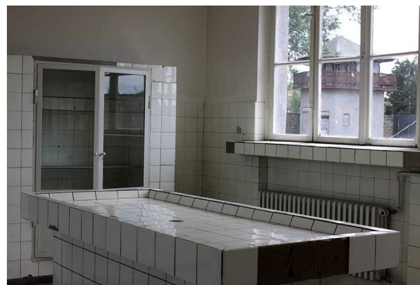
Figure 1 Dissection room at the Sachsenhausen concentration camp in Germany. Prisoners with advanced neurosyphilis were euthanized here.

In 1939 Hitler authorized certain physicians to undertake mercy killings, and a network of companies and facilities for eliminating patients was created. The physicians were required to fill in forms and send them to number 4 Tiergartenstrasse in Berlin, giving the program a name: Action, or Operation, T4. 22-24 The forms made specific mention of "refractory paralysis and other sequelae of syphilis."