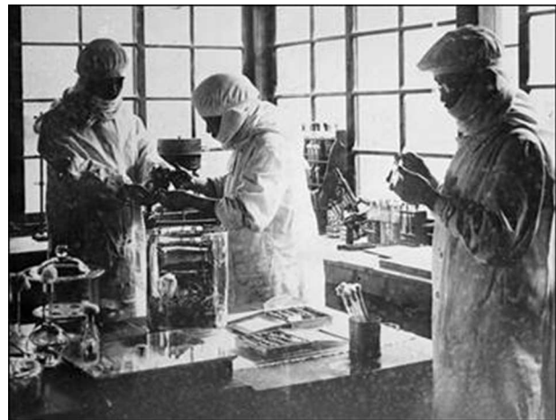
Figure 3 Manchuria, China: Unit 731 physicians performing routine work.

Social and political indifference to human experimentation began to shift by the early 1970s, however, following the thalidomide birth defects crisis and after the public was alerted to the Tuskegee experiments. Numerous articles and books about medical ethics appeared as more and more people began to denounce the use of prisoners and other institutionalized individuals in experiments; next, the practice was condemned and studies were closed down. 42