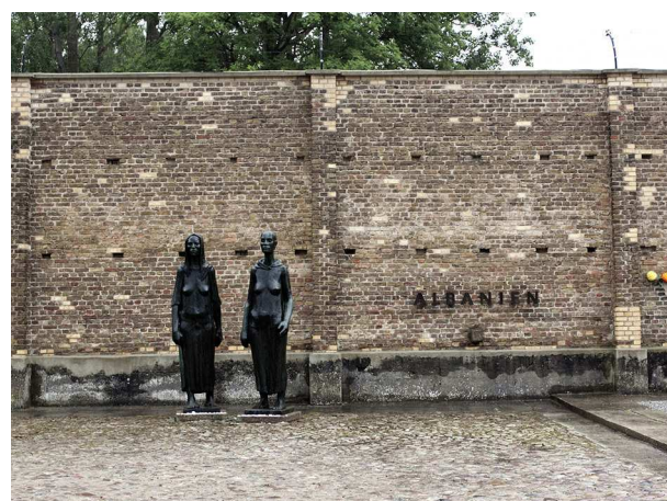
Figure 2 Concentration camp for women in Ravensbrück, Germany. Promised freedom, the prisoners were transferred to other camps to work as prostitutes. None were freed and many contracted venereal diseases.

Patients were euthanized in 6 facilities masquerading as hospitals. Some 70 000 individuals were killed by carbon monoxide inhalation until pressure from Christian churches stalled the program in 1941. Afterwards, the more clandestine practice of so-called wild euthanasia commenced and another 110 000 patients were eventually killed with morphine and barbiturates in institutions and hospitals located away from population centers.