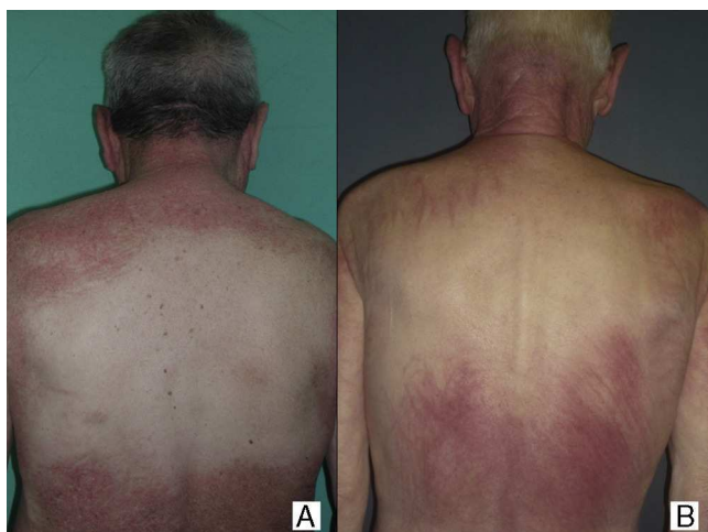
Figure 4 Sparing of the central area of the back in patients no. 2 (A) and no. 3 (B). Flagellate erythema can be seen in both cases. (See also Fig. 2.)

general. Because our study did not include a control group of adults with dermatomyositis not associated with cancer, we cannot state whether the prevalence of skin necrosis (25% in our series) was higher or lower than the prevalence in the population with non-paraneoplastic dermatomyositis. In a recent study of 39 cases of dermatomyositis, 11 of them paraneoplastic, the proportion of cases with skin necrosis was the same in the group associated with cancer and in the overall group. 25 Another series of patients with dermatomyositis associated with anti-MDA5 antibodies 23 also showed no relationship between skin necrosis and paraneoplasia, although those are unpublished data (personal report from Dr. David Fiorentino). Unfortunately, the largest studies of paraneoplastic dermatomyositis within the adult dermatomyositis population have not reported comparative data of the frequency of skin necrosis in the 2 groups of patients. 2-4