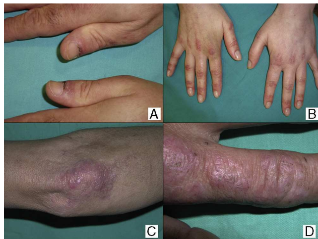
Figure 6 A, Cuticular necrosis in patient no. 4. B, Gottron papules and periungual erythema on the hands of patient no. 5. C and D, Gottron papules on the hands and elbows of patient no. 1.

in various studies of adult dermatomyositis; this is the presence of interstitial lung disease. Lung involvement is considered to be a marker of a low risk of neoplasm in dermatomyositis. 3,23 Of our patients, only one (case 10) had interstitial lung disease. That patient had a history of bladder cancer 4 years before onset of the dermatomyositis and developed tumor recurrence 15 months after the skin manifestations appeared. The lung involvement was severe and, although it was detected in the tumor screening studies performed after making the diagnosis of dermatomyositis, it subsequently caused to pneumothorax with surgical emphysema. It is not known why dermatomyositis with interstitial lung disease is associated with a lower probability of cancer. It has been suggested that the prognosis of the lung disease is so poor that the short life expectancy of the patient leaves insufficient time for the cancer to be detected. However, this is just a theory that has not yet been confirmed.