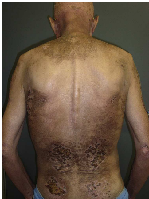
Figure 2 Widespread, crusted erosive lesions on the back of patient no. 4. Note the absence of lesions in the central area of the back.