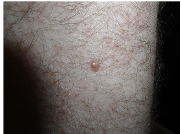
Figure 1 Papular skin-colored lesion on the left thigh.

In cells with wild-type BRAF , vemurafenib increases phosphorylation of ERK (extracellular signal-regulated kinase) and thus paradoxically induces hyperactivation of the MAPK signaling pathway, promoting cell proliferation and survival. Hyperactivation is responsible for adverse effects such as keratoacanthoma, squamous cell carcinoma, and actinic keratosis. This paradoxical activation effect can also trigger progression of benign melanocytic lesions to melanoma. 6 Atypical melanocytic proliferation and the development of new melanomas have been described in patients undergoing treatment with vemurafenib, and vemurafenib-induced changes in preexisting nevi have been observed by dermoscopy. 7