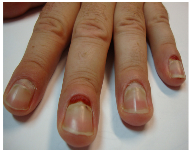
Figure 1 Pyogenic granulomas in the proximal nail fold of the second and fourth finger of the right hand and detachment of the nails of the second to fifth fingers.

The association of onychomadesis and pyogenic granuloma after limb immobilization with a plaster cast after surgery was reported in a series of 9 patients by Tosti et al. 2 in 2001. No other reports have been published in the literature to date. The authors believed that the nail disorders were caused by mild damage to the peripheral nerve after immobilization. All patients were men between 15 and 42 years old with a bone fracture requiring plaster-cast immobilization for 1 to 3 months. The lesions appeared between 7 and 30 days after removing the cast. Similar changes have been reported in patients with reflex sympathetic dystrophy. 3,4 This condition is also accompanied by other clinical manifestations such as pain, vascular changes, excessive sweating, edema, and functional limitation. 5 Atrophy and even skin ulcers may also be seen. 6 These findings