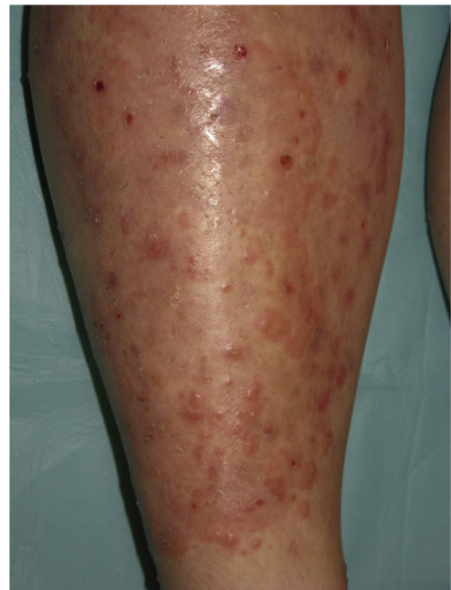
Figure 1 Erythematous papules and plaques with circinate borders and peripheral vesicles.

PH is a variant of pemphigus that generally has a good prognosis, and most patients respond to sulfones. 5 PH has a wide spectrum of clinical and histologic findings and accordingly numerous autoimmune blistering disorders must be considered in the differential diagnosis, namely, dermatitis herpetiformis, linear IgA bullous dermatosis, PF, PV, and bullous pemphigoid. 6 Histologic findings can vary according to the stage of the disease and the type of lesion biopsied. Varying degrees of neutrophilic and/or eosinophilic spongiosis, with or without acantholysis in the middle and/or subcorneal layer, are observed. Kuhn et al. 7 found that the inflammatory infiltrate in patients with PH was 68% eosinophil-dominant, 16% neutrophil-dominant, and 16% mixed eosinophil/neutrophil. We would like to stress the importance of performing direct immunofluorescence to test for the presence of an autoimmune blistering disorder when histology reveals neutrophilic and/or eosinophilic spongiosis.