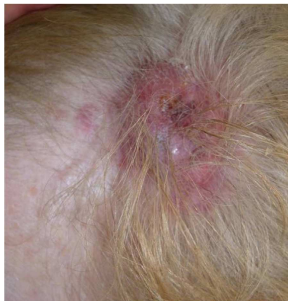
Figure 1 Erythematous violaceous tumor with a 4-cm diameter and peripheral macular lesions.