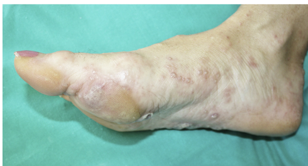
Figure 1 Palmoplantar vesicles of 24 hours duration.

It should be noted that although dyshidrosiform linear IgA dermatosis is rare, several cases have been reported. 7,8