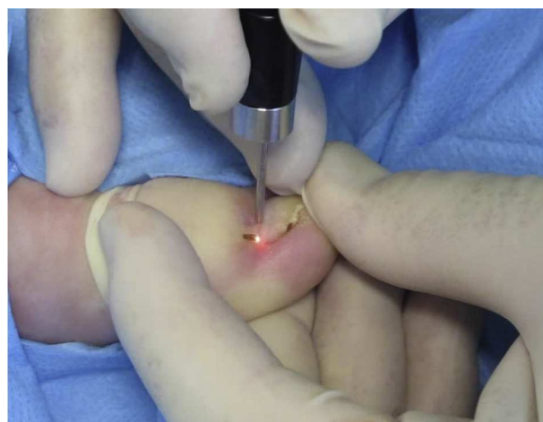
Figure 1 Partial nail matricectomy with carbon dioxide laser.

Two hemostatic sponges are placed on the surgical wound and covered with mupirocin ointment and a sterile gauze dressing.