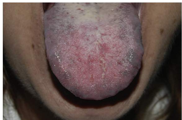
Figure 1 Pigmented grey-blue macules, located mainly on the lateral areas of the dorsum of the tongue.

Hyperpigmentation of oral mucosa associated with interferon alfa and ribavirin combination therapy for hepatitis C