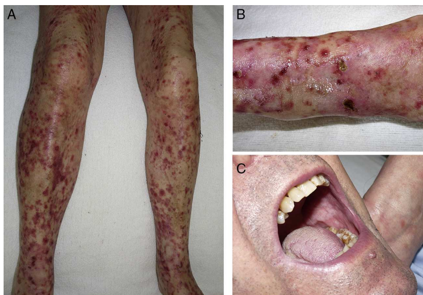
Figure 1 A, Erythematous violaceous lichenoid plaques covering the patient's legs. B, Detail of lichenoid plaques with a necrotic component on the dorsal aspect of the foot. C, Whitish papules arranged in a cobblestone pattern on the oral mucosa.

The patient, a 70-year-old man, had undergone a cadaveric liver transplant for cirrhosis due to hepatitis C virus infection. The crossmatch results were negative. The HLA of the donor was *1 A*68 B*39 B*39 DRB1*17 DRB1 *17 while that of the recipient was A*1 A*1 B*35 B*78 DRB1*13 DRB1*13. The patient was started on immunosuppressive treatment with tacrolimus and prednisone and was also prescribed ranitidine for gastric protection. On day 16 posttransplant, he developed an asymptomatic centrifugal maculopapular rash. The blood test results were normal and serology for cytomegalovirus, Epstein-Barr virus, and parvovirus B19 were negative for acute infection. A drug-induced reaction was therefore suspected and the skin biopsy findings were consistent with this hypothesis. Ranitidine was identified as the most probable cause and withdrawn; prednisone