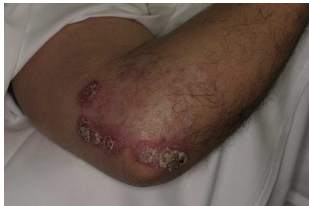
Figure 1 Firm contiguous plaques with crusted areas on an erythematous base and a larger area with a scar-like appearance.

Physical examination revealed indurated, erythematous, contiguous plaques with warty, crusted areas; adjacent to these plaques was a larger whitish area with a scar-like appearance (Fig. 1). The regional lymph nodes were not palpable.