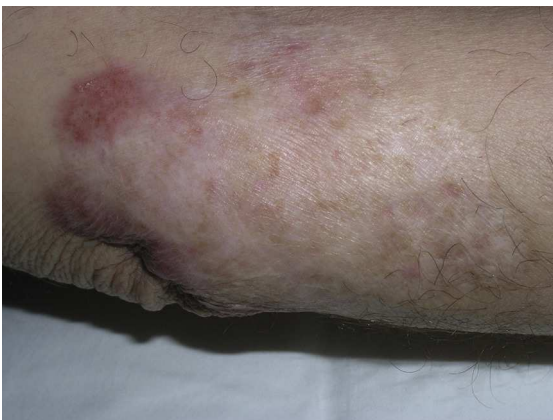
Figure 3 Residual scar-like lesions.

Chromoblastomycosis is difficult to treat because of differences in antifungal sensitivity patterns and responses among the species isolated and also because of the refractory nature of the condition, particularly in more serious clinical forms. The different treatment modalities available have not been compared in clinical settings. Recurrence is common, hence the recommendation for long-term treatments, lasting between 3 and 18 months, depending on the study. 4 Possible complications include secondary bacterial infection with lymphadenitis and, less frequently, the development of squamous carcinoma in lesions that have been present for a very long time. 5 In our case, the only complication was secondary impetiginization, which was resolved with topical antibiotics.