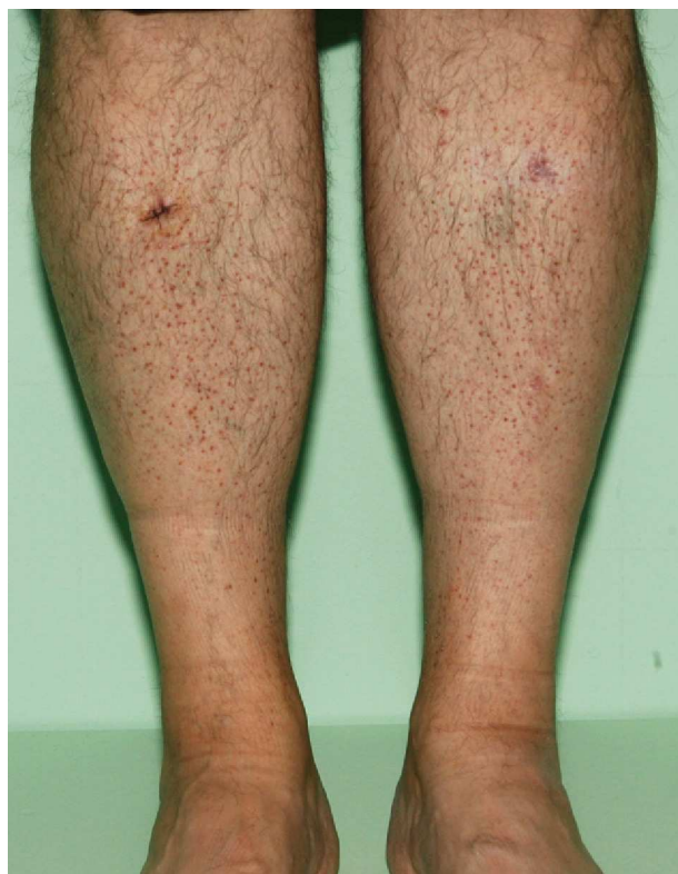
Figure 1 Reddish papules distributed symmetrically on the legs.

Today, 18 months later, the patient is free of lesions and other signs of mycosis fungoides.