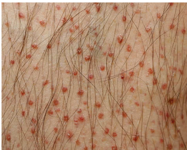
Figure 2 Detail of the skin surface showing red papules, some of which are covered with scales.

fungoides is not very aggressive but also agree that patients should be followed up, because in 1 case it has been reported to progress to plaque-phase mycosis fungoides. 3 Prognosis is favorable in this subtype, except in patients with previous symptoms of mycosis fungoides, in whom it indicates disease progression. 5