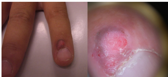
Figure 1 Red-grayish exophytic periungual lesion with a hyperkeratotic surface.

Physical examination revealed a red-grayish exophytic periungual lesion measuring 0.7cm in diameter with a hyperkeratotic surface (Fig. 1). Histopathologic examination showed a hyperplastic epidermis with loss of normal cell architecture, moderate cellular atypia, dyskeratosis, and koilocytes in the epidermis (Fig. 2). Overexpression of the tumor suppressor protein p16 was also observed (Fig. 3). Based on a diagnosis of extragenital bowenoid papulosis, the patient was re-questioned, but he reported that neither he nor his current partner had had genital or anal warts. Lymphocyte counts (including CD4 and CD8 counts) were normal and serologic testing for human immunodeficiency virus (HIV) was negative. Human papillomavirus (HPV) DNA testing using the hybrid capture assay detected HPV 42. It was decided to excise the entire lesion and schedule periodic