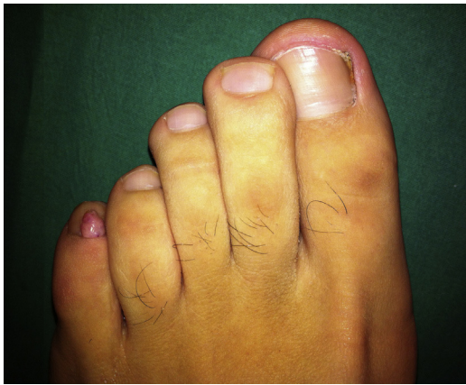
Figure 1 Acral fibrokeratoma on the fifth toe of the left foot.

surgical field. Two longitudinal incisions were then made into the proximal nail fold, one on each side of the lesion. The proximal nailfold was then elevated (Fig. 2), exposing the whole tumor and enabling us to dissect and excise the lesion completely. During the procedure, special care was taken not to damage the matrix.