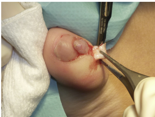
Figure 2 Banner flap: 2 longitudinal incisions are made into the proximal nail fold, one on either side of the lesion.

Acral fibrokeratoma is a benign and typically solitary tumor. It is the color of normal skin and may be dome- or horn-shaped. This tumor may arise secondary to trauma. 1 The term acral fibrokeratoma encompasses several entities, including acquired digital fibrokeratoma, acquired periungual fibrokeratoma, “garlic-clove” fibroma, and the