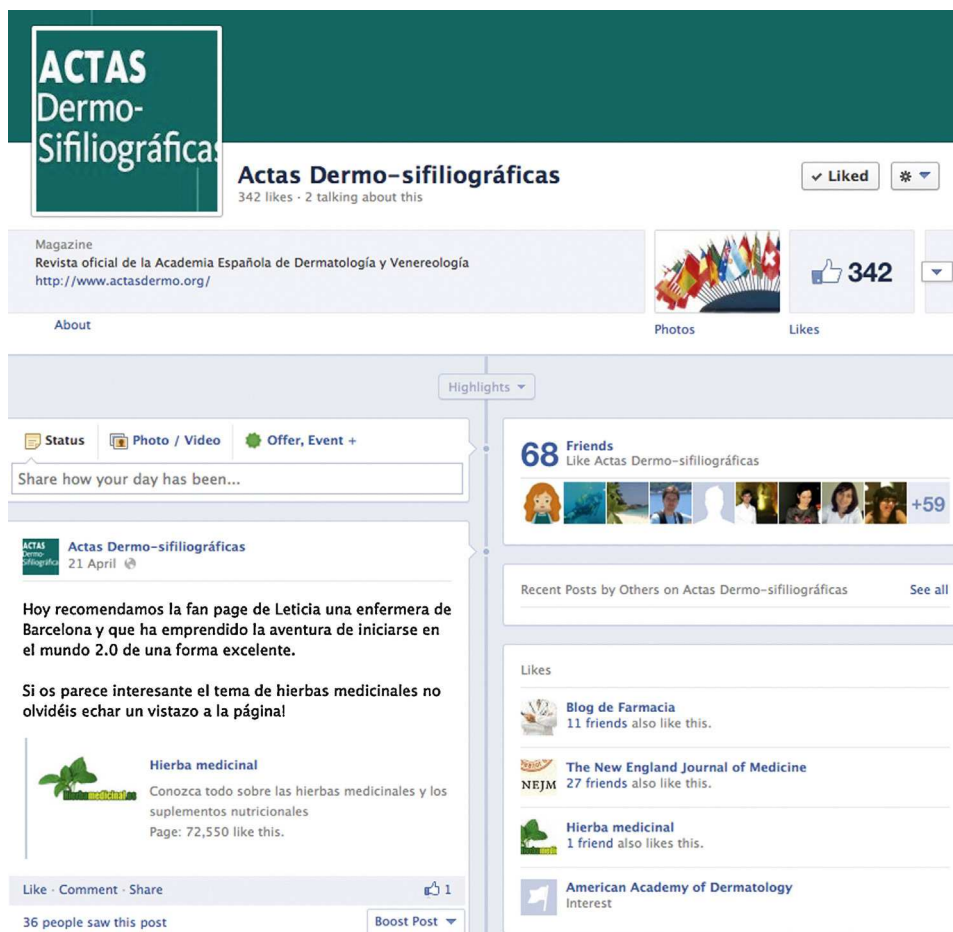
Figure 1 Screenshot of the Actas Dermosifiliográficas Facebook page.

dermatology. The task was not just to involve the dermatologists who were already familiar with the world of Web 2.0, but also to strive to make Actas a gateway to the social media for dermatologists accustomed to more traditional channels. To this end, we decided to start by creating a profile for Actas on the two social networks with the most influence and number of users worldwide: Facebook and Twitter.