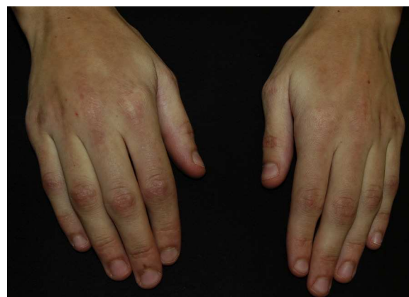
Figure 2 Atrophic erythematous lesions in the interphalangeal joints of the fingers.