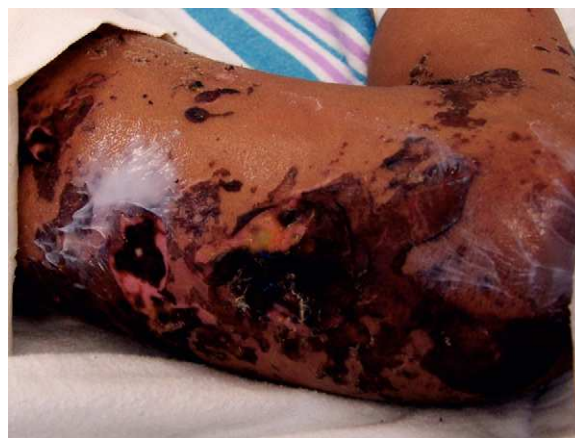
Figure 1 Widespread areas of purpura and necrosis on right lower extremity with lysed bullae and crusting.

Blood cultures came back as predominantly gram positive cocci in chains consistent with Streptococcus pneumoniae . The antimicrobial regimen was adjusted to linezolid, vancomycin, meropenem, abelcet, and ganciclovir for active coverage of S. pneumoniae septicemia and