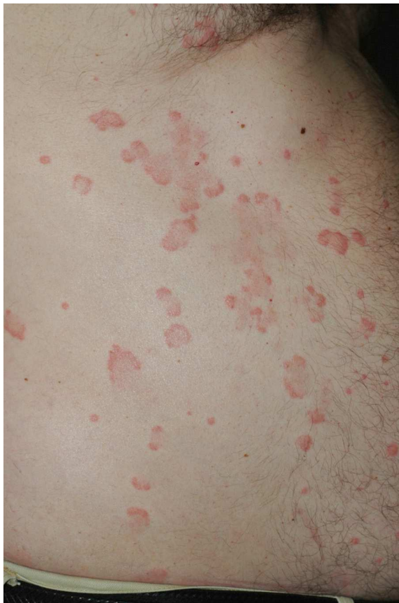
Figure 1 Urticarial plaques with purpuric borders on the trunk.

The lesions lasted for over 24 hours in 14 patients (93%) including all 7 patients with low complement levels. They