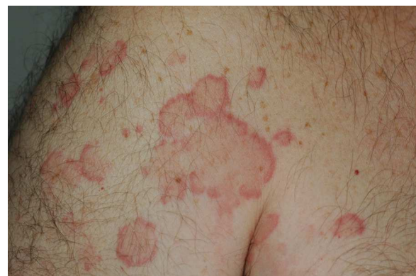
Figure 2 Erythematous edematous lesions with purpuric borders at the top of the arm.

ANA positivity was observed in 5 patients (33%), all of whom had an associated systemic condition. The same 5 patients also had low complement levels, demonstrating a significant association between ANA positivity and hypocomplementemia ( P = .002 ).