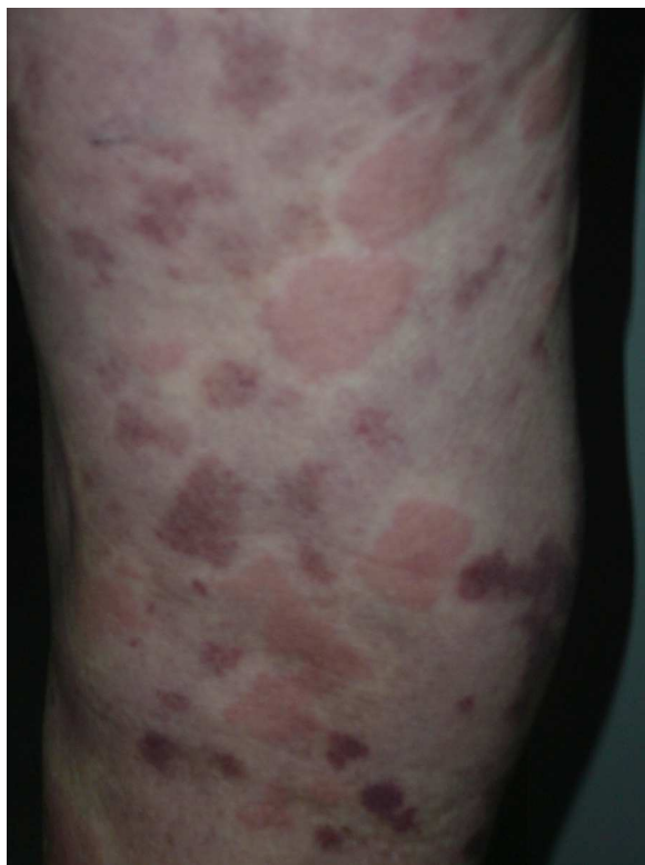
Figure 3 Residual purpuric plaques and erythematous, edematous lesions on the leg.

Seven patients (46.66%) had UV as the sole manifestation of disease and 8 (53%) had associated systemic involvement. The systemic disease preceded UV in 1 case and developed at the same time in the other 7. The most common associated disease was SLE (3 cases, 37.5%); the other diseases (present in 1 patient each, 12.5%) were mixed connective-