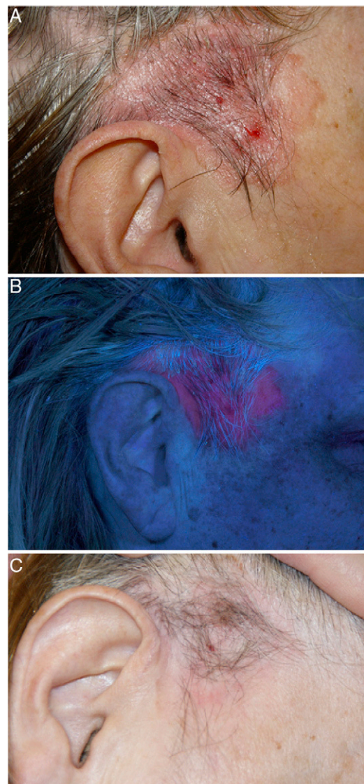
Figure 1 A, Erythematous plaque measuring 5 cm located in the right temporal region and extending towards preauricular hairless skin, with a periphery marked by linear pigmentation. B, Plaque displaying intense red fluorescence after a 3-hour incubation period with methyl aminolevulinate. C, Complete remission 2 months after the second photodynamic therapy session.

Histologic study of 2 biopsies, 1 from the center and 1 from the edge of the lesion, revealed the occupation of the epidermis by a population of large cells with clear cytoplasm and atypical nuclei, arranged singly or in nests and accompanied by little melanin pigment. These cells had spread to the adnexa but there was no dermal infiltration (Fig. 2 A and B). The atypical cells occupying the epidermis were positive for cytokeratin 7 (Fig. 2G) and cytokeratin CAM5.2, but these markers were not expressed in the surrounding epidermis. The nuclei tested positive for estrogen receptors (Fig. 2C). Her2 membrane expression was intense and continuous (Fig. 2D). Other positive markers were carcinoembryonic antigen (Fig. 2E), gross cystic disease fluid