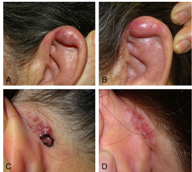
Figure 1 A, Angiolymphoid hyperplasia lesion before treatment. B, Angiolymphoid hyperplasia lesion after treatment with intralesional corticosteroids. C, Original retroauricular angiolymphoid hyperplasia lesion. D, Angiolymphoid hyperplasia lesion that recurred after surgery.

None of the patients had peripheral eosinophilia, palpable lymph nodes, or a history of trauma in the area of the