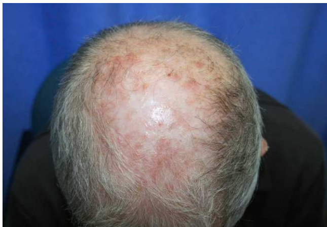
Figure 3 Note the improvement after 2 sessions of PDT.

Six months later, the improvement in the treated area was maintained and the patient is currently awaiting a further session on the occipital region to treat new actinic keratoses.