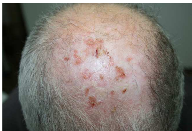
Figure 1 Active lesions of erosive pustular dermatosis of the scalp together with actinic keratoses.

We present the case of a 79-year-old man with skin phototype III and actinic keratosis of the face and scalp, occasionally treated with cryotherapy, after which the patient would complain of painful erosions in the treated area. On one of his check-up visits he had an outbreak of pustules and scabs that mainly affected the posterior part of the parietal region. The pustules had an erythematous base, and painful erosions and scabs were also visible. Biopsy revealed areas of fibrosis, a predominantly perifollicular neutrophil infiltrate, and areas of scarring. The diagnosis was erosive pustular dermatosis of the scalp, which responded favorably to topical treatment with fusidic acid plus betamethasone cream and healed with scarring alopecia. Thereafter, actinic keratoses in this patient were successfully treated with topical imiquimod to prevent outbreaks of pustulosis. During follow-up, however, he presented with hypertrophic actinic keratoses in the occipital region and numerous pustules that coalesced into lakes of pus (Fig. 1). These actinic keratoses did not respond to imiquimod and the erosive pustular dermatosis of the scalp worsened with the use of this agent. It was then decided to try treatment with photodynamic therapy (PDT). At the first session, curettage of the most hypertrophic actinic keratoses was performed and this was followed by an application of Metvix ® (160 mg/g methyl aminolevulinic acid hydrochloride cream; manufac-