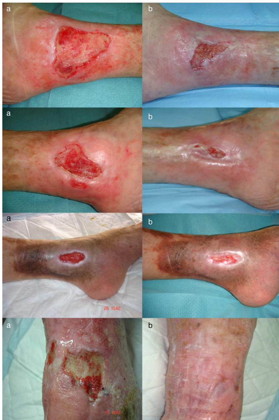
Figure 1 Ulcer size. A, week 0. B, week 16.

stems from the fact that the membrane's antimicrobial, antiinflammatory, analgesic, antiangiogenic, and reepithelializing properties 5,7,9,10,12,17-21 are considered ideal characteristics for a dressing. 3 Amniotic membrane is also easy to obtain and does not require invasive application techniques.