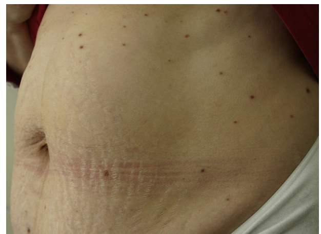
Figure 1 Multiple round erythematous-violaceous maculopapular lesions measuring up to 6 or 7 mm, on the abdomen.

MCAH is considered to be a dermal dendrocyte proliferation. Some authors consider it to be a variant of dermatofibroma 1 ; as with dermatofibroma, it is difficult to determine whether MCAH is a true neoplasm or a reactive process. 2 MCAH presents in healthy persons and reported associations with other diseases appear to be coincidental. Several factors support the idea that this is a reactive entity: the fact that some patients present with multiple lesions, the location of lesions in sites exposed to trauma and insect bites, the absence of a familial association, and the spontaneous regression reported in some cases. A link to hormone factors has been suggested, as these lesions present more frequently in women (79% of cases) and have been associated with overexpression of estrogen receptor \alpha . 3