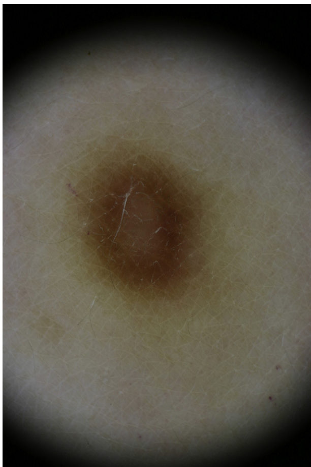
Figure 2 Dermoscopic image of a lesion, showing a fine reticular pattern mainly around the borders and a central whitish patch.

Including our patient, 5 cases of generalized MCAH have been reported to date: 3 men and 2 women 4-7 aged between 24 and 56 years with no associated disease. Of note in our case is the coincidence of the eruptive appearance of the lesions and each pregnancy, and the finding of anti-Ro 60 antibodies with a history of the death of a newborn baby.