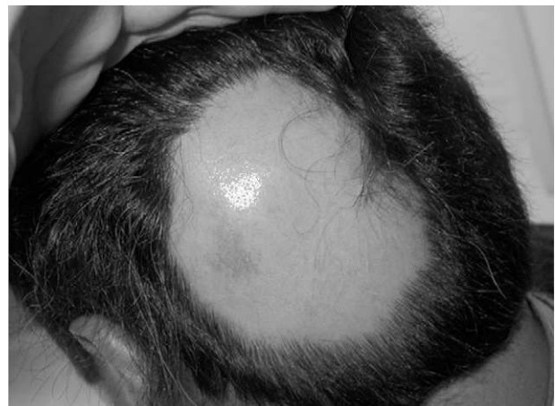
Figure 1 Alopecia areata plaque located on the cranial vertex after a year of adalimumab treatment.

\alpha (TNF- \alpha ) and has been approved for the treatment of rheumatoid arthritis, ankylosing spondylitis, Crohn disease, psoriasis, and psoriatic arthritis. TNF- \alpha is a proinflammatory cytokine in the body's immune system, but when it is neutralized by anti-TNF- \alpha antibodies like adalimumab, autoimmune disorders such as systemic sclerosis and systemic lupus erythematosus have been known to develop. 1 The role of TNF- \alpha in the physiopathology of these processes is complex, but the cytokine has been shown to originate in the mononuclear cells that surround the hair follicle in AA 1 and inhibit hair follicle growth during in vitro testing. 2 TNF- \alpha is thus linked to hair loss. Accordingly, anti-TNF- \alpha medications and other biologic therapies have been used to treat AA, but with poor results; in some sporadic cases satisfactory responses have been reported, but no large study has demonstrated any significant therapeutic effects of etanercept, 3 alefacept, 4 or efalizumab. 5