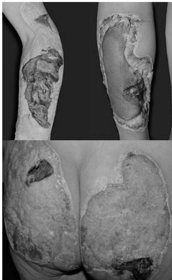
Figure 1 Photograph at presentation. Ulcers with a purulent exudate and covered with necrotic slough.

psychiatry department diagnosed the patient as having a mixed personality disorder and treatment was initiated with amitriptyline, perphenazine, and diazepam. The general surgery department then performed surgical debridement of the ulcers and escharectomy. The patient was treated with antibiotics (trimethoprim-sulfamethoxazole, 160/800 mg, administered intravenously every 12 hours for 14 days), analgesics, and thalidomide (100 mg/d); prednisone (0.5 mg/kg) was added after achieving control of the infection. The response was satisfactory and the patient was discharged