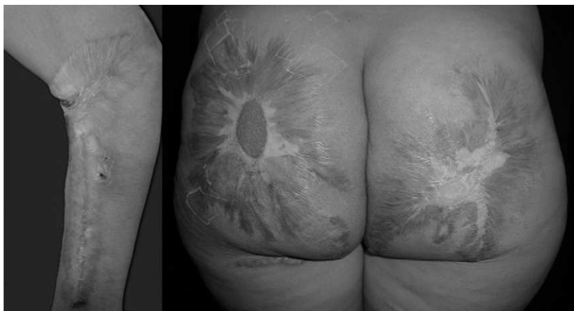
Figure 3 Photograph at 7 months of follow-up. There is reepithelialization of the lesions and scarring.

The management of these patients is still a matter of debate, but good outcomes have been reported with the use of systemic steroids, nonsteroidal immuno-