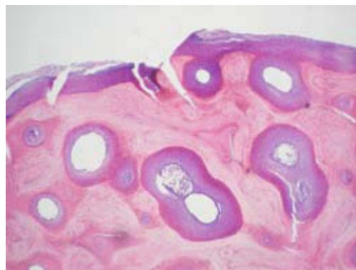
Figure 3 Hematoxylin-eosin, original magnification \times 40 .