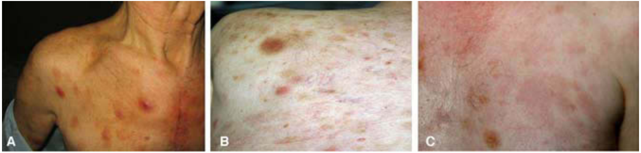
Figure 1 A, B, and C, nodules and asymptomatic erythematous-violaceous plaques on the trunk and extremities.