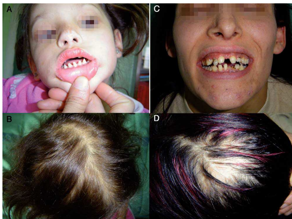
Figure 1 A and B. Clinical features of the proband. C and D. Clinical features of the proband's mother. The proband has pointed teeth, absence of the tails of the eyebrows, a congenital scarring lesion on her nose (A), and sparse thin hair (B). Her mother exhibits similar clinical signs (C and D). She never developed her adult dentition.

After giving their informed consent, genomic DNA was obtained from peripheral blood from the proband and from her family members. PCR amplification of the EDA gene obtained from the DNA samples was performed. The PCR