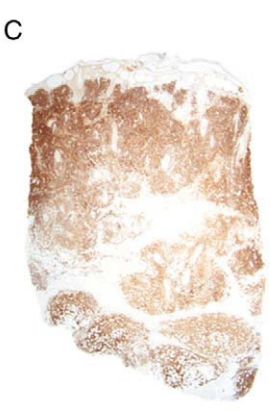
Figure 2 A, Dense lymphocytic infiltrate affecting the full thickness of the dermis and reaching the subcutaneous tissue (hematoxylin-eosin, original magnification x20). B, Lymphoid cells with abundant cytoplasm, marked pleomorphism, mitotic activity, and atypia (hematoxylin-eosin, original magnification, x200). C, Intense positivity for the CD30 marker in almost the entire specimen (x20).

surgical resection.<sup>10</sup> In our case, given the initial diagnosis of primary nodal ALCL, chemotherapy was chosen to treat the recurrence.