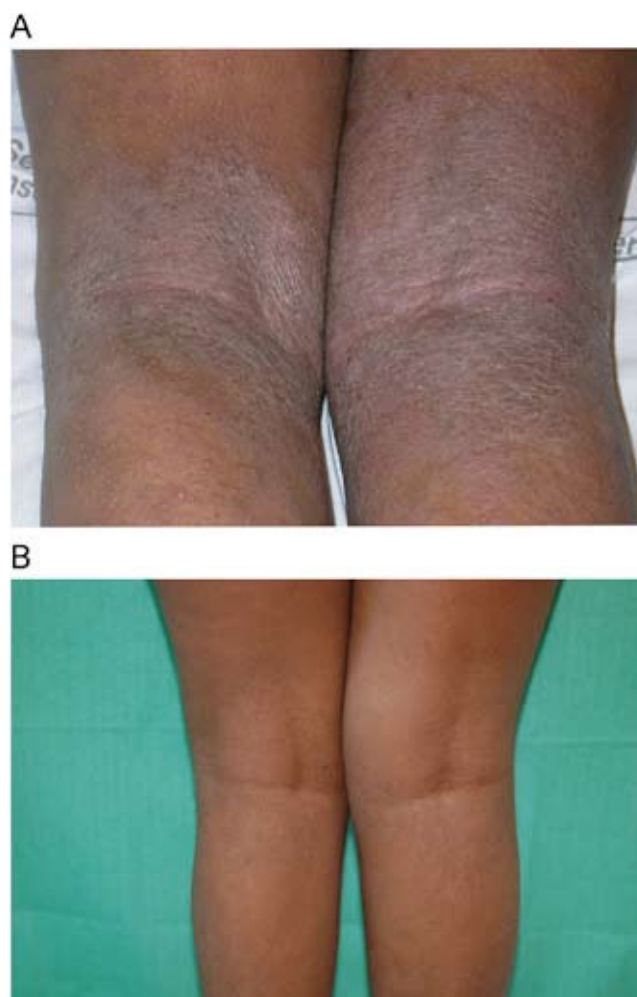
Figure 2 A, Case 6 before start of treatment. B, Case 6 after 6 months of treatment.

11% with intermediate expression, and 1 of every 200 or 300 patients with deficient enzymatic activity. 16