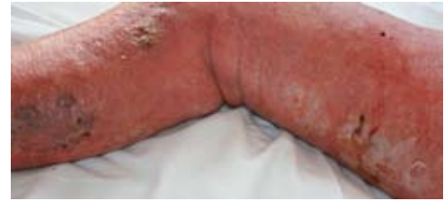
Figure 2 Edematous erythematous plaque with blisters, erosions, and ecchymoses on the right leg.