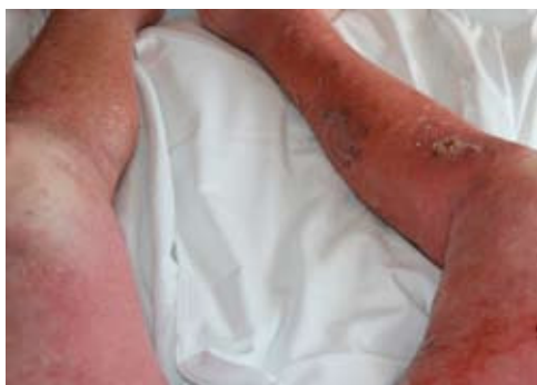
Figure 1 Erythematous plaques affecting both legs.

We describe the case of an 80-year-old patient with a 20-year history of rheumatoid arthritis, and who had received treatment for several years with methotrexate 7.5 mg/wk and methylprednisolone 12 mg/d. One month before admission, the dose of methylprednisolone had been increased to 20 mg/d due to worsening of joint pain. Other important aspects of the patient's history included bilateral knee prostheses, chronic kidney failure, and anemia of multifactorial origin. The patient was admitted for pain and edema in the left leg that had started 10 days earlier and empirical antibiotic treatment was started with amoxicillin-clavulanic acid. During his admission, the patient developed fever and the condition of his leg began to deteriorate. Examination showed edematous, erythematous-violaceous plaques and tense blisters that rapidly became more extensive, affecting both legs, the back, and right arm (Figures 1 and 2), while sparing the perineum. Deep vein thrombosis was ruled out by echo-Doppler. In view of the persistence of the fever, antibiotic cover was increased by the administration of piperacillin, tazobactam, and teicoplanin. Skin biopsy was also performed, with pathological findings of moderate edema of the dermis with slightly dilated vessels and the presence