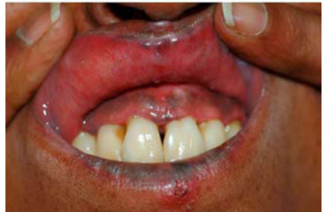
Figure 2 Hyperpigmented macule in palatal mucosa. Mucosal hyperpigmentation.