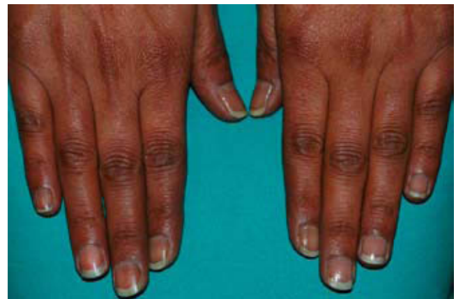
Figure 3 Hyperpigmentation on fingernails and backs of the hands.