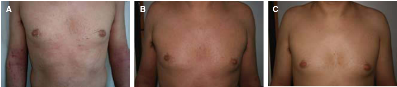
Figure 1. A. Patient with an initial Severity Scoring of Atopic Dermatitis (SCORAD) index of 55. B. Response to treatment with mycophenolate mofetil 1 g/12 h for 4 weeks (SCORAD 28). C. Response after 3 months (SCORAD 15).