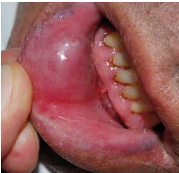
Figure 1. Violaceous nodule with a diameter of 2 cm, located in the mucosa of the lower lip.

Actinomyces is produced by various species of the genus Actinomyces , particularly Actinomyces israelii . These are branching, pleomorphic, filamentous, gram-positive bacilli that are obligate or facultative anaerobes and are not acid or alcohol fast. They form part of the normal flora of the mouth, gastrointestinal tract, and female genital