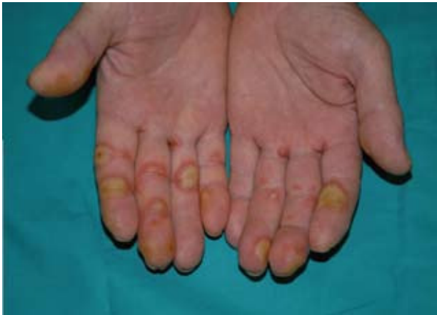
Figure 1. Yellowish hyperkeratotic papules with symmetrical erythematous halo.

Sorafenib is a new oral drug currently approved for the treatment of metastatic renal cell carcinoma and hepatocellular carcinoma. The drug acts partly by inhibiting the tyrosine kinase receptors implicated in angiogenesis and tumor progression, and partly by blocking Raf kinase pathways. Up to 90% of patients receiving this treatment are reported to develop dermatological side-effects. Hyperkeratosis-like lesions commonly appear on the pressure pads of palms and soles and this may require withdrawal of the medication in more serious cases. 1,2