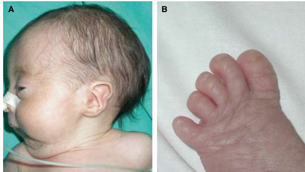
Figure 1. A, Characteristic dysmorphic facies with hypertelorism, low-set ears, and retrognathia. There is associated hirsutism of the forehead. B, Unguis hypoplasia of the toes.