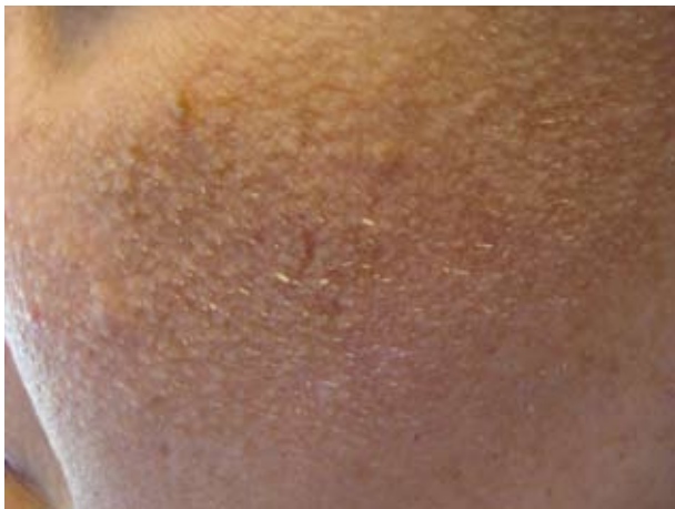
Figure 1. Multiple, filiform, follicular hyperkeratotic lesion on the left cheek.

Hyperkeratotic spicules are rare skin lesions of unknown origin, defined by the presence of multiple areas of circumscribed hyperkeratosis formed of keratotic material that protrudes from the stratum corneum. 1 The